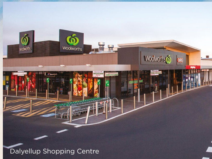
Dalzell Shopping Centre