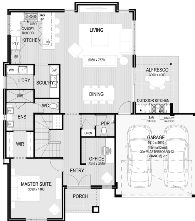
GROUND FLOOR 1:100