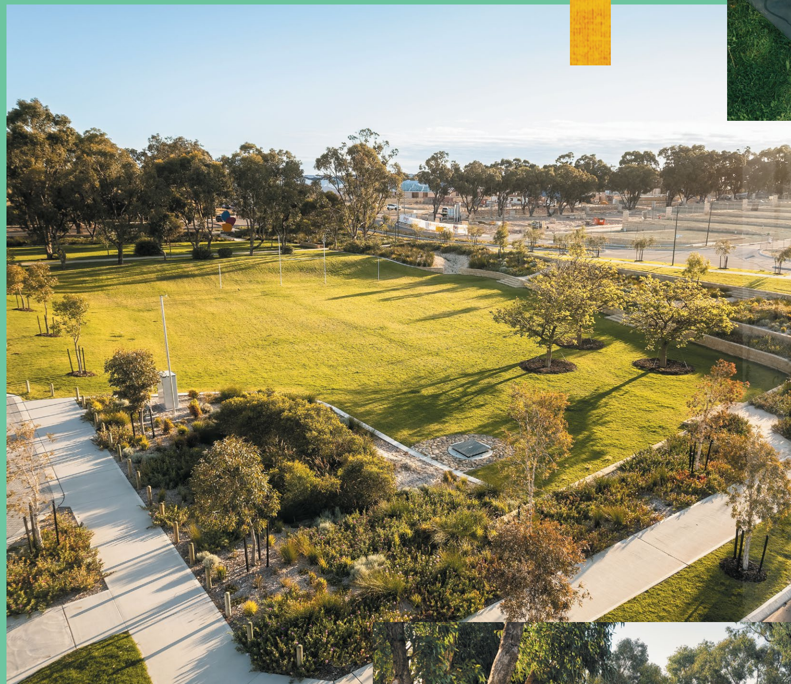
Park and public open space.