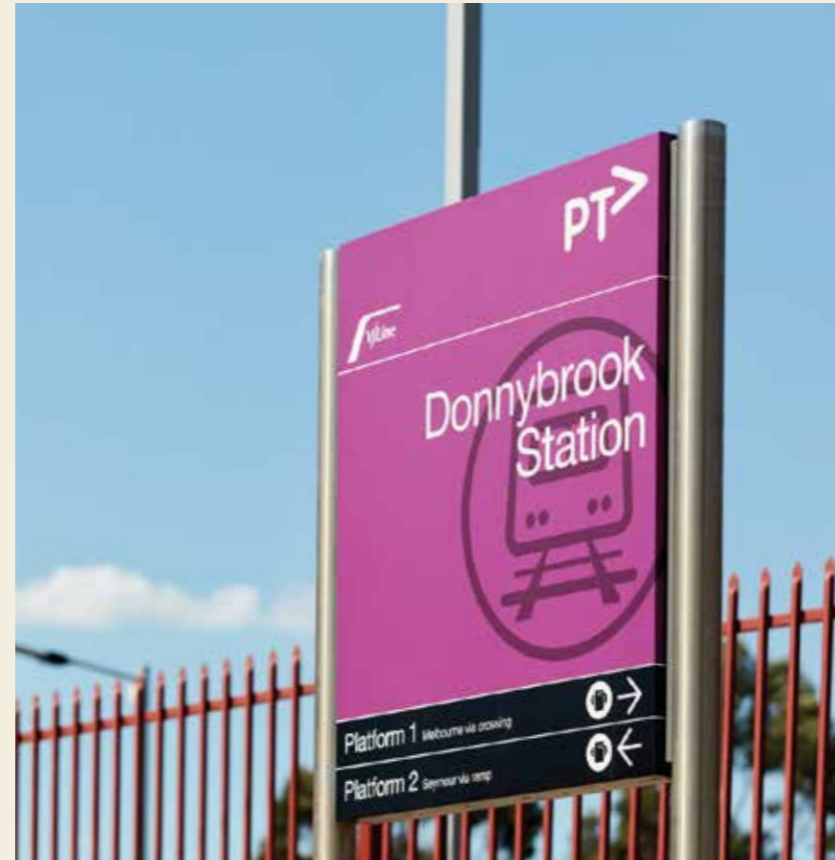
Donnybrook Train Station

Quality education is made effortless, with a proposed government primary school and community centre planned within Heartford. Less than a kilometre away, Hume Anglican Grammar caters for Prep to Year 12, while nearby options Donnybrook Primary, St Mary's Catholic Primary, and Mount Ridley College ensure families have exceptional choices at every stage. From early learning to graduation, Heartford offers a complete pathway for children to learn, grow, and thrive.