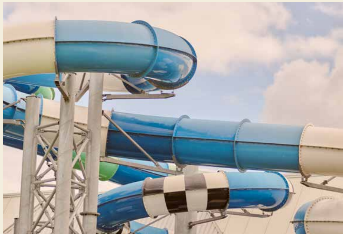
Splash Aqua Park