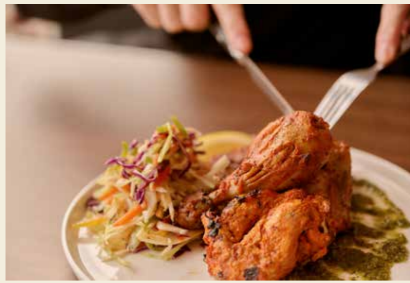
The Tandoori Joint